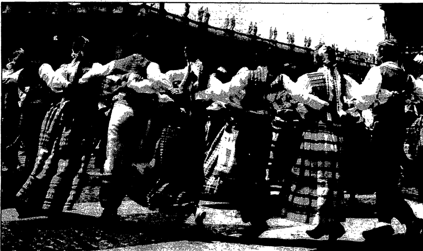
Members of the Rochester Lazdynas Folk Dancers along with Lithuanians from around the world performed traditional dances in St. Peter's Square.