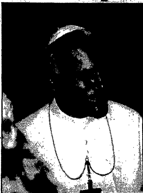
The pope holds a special audience with Lithuanians.