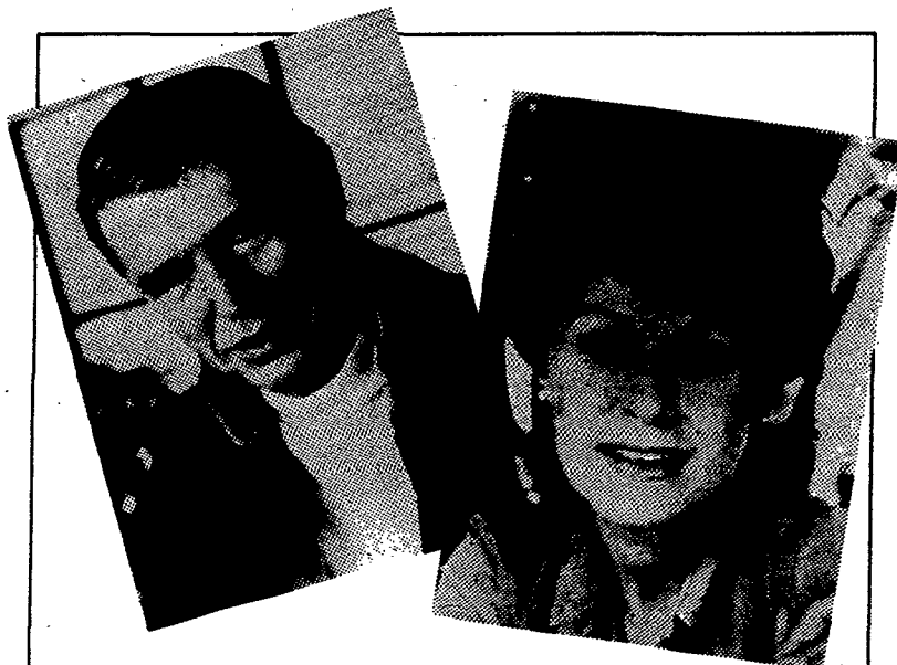
The Founders Club of The Sisters of Mercy Presents ROGER WILLIAMS AND ROBERTA PETERS