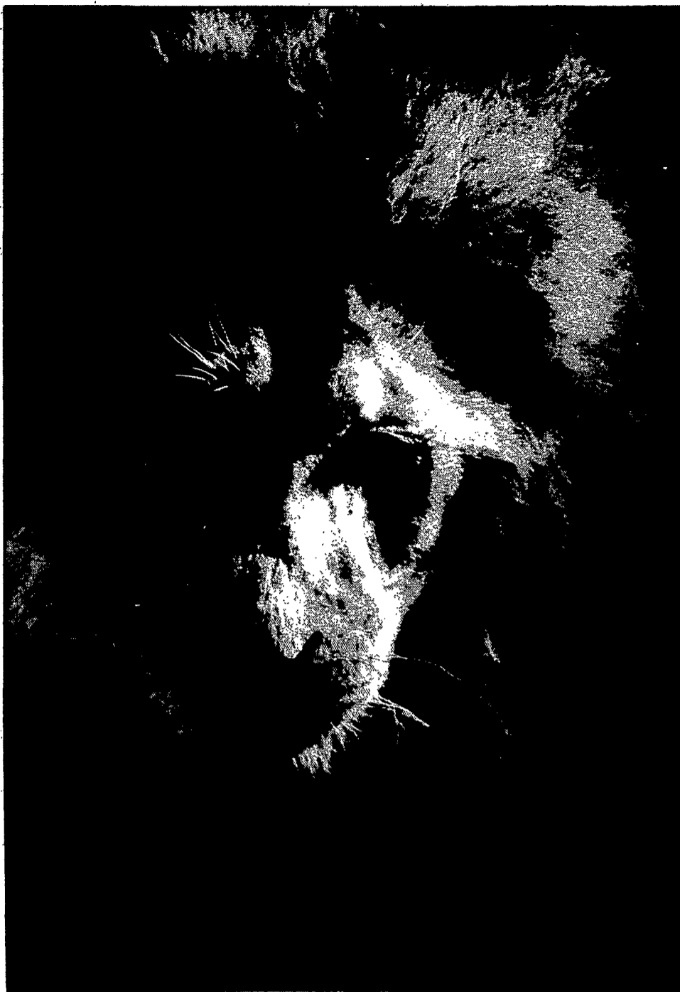
In like a lion?

LENTEEN SHARING SUPPER: hosted by the Social Ministries Committee of St.