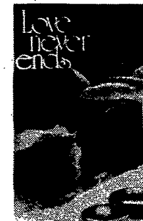
A LARGE SELECTION OF WEDDING BULLETIN COVERS