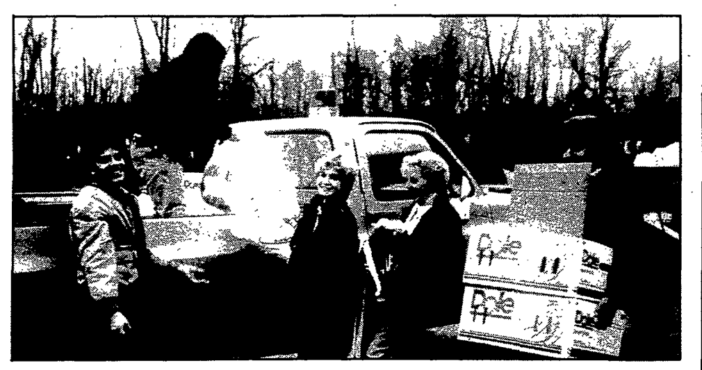
Cardinal Mooney students share a laugh as they load one of two pickup trucks with food, clothes and gifts targeted for needy families in the Rochester area.