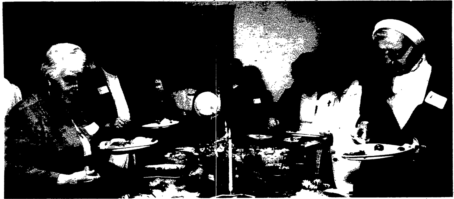
Jubilarians partake of a buffet luncheon that concluded the day's events.