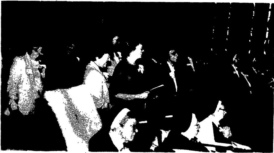
Decades of faithful service to the Church were represented at the Sisters of Mercy jubilarian ceremony Sunday, September 21, at the Mercy motherhouse.