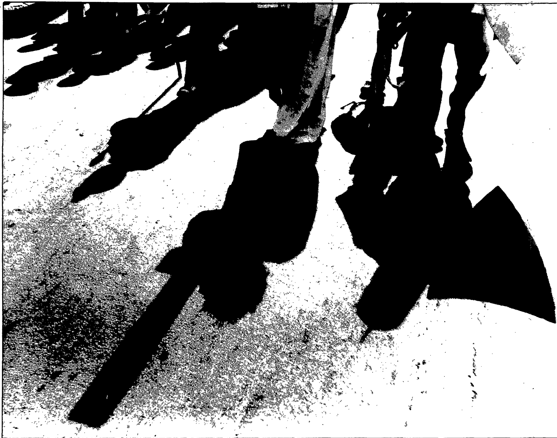
Shadows create eerie images on the pavement as Perez leads the procession down Scio Street, a road that served as one of those "leading to Calvary."