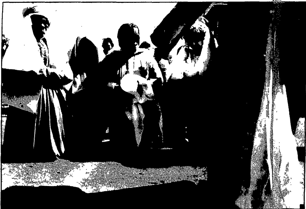
Four "women of Jerusalem" kneel at the feet of Jesus as he tells them "don't weep for me, weep for yourselves and your children," during the reenactment of the Eighth Station of the Cross.