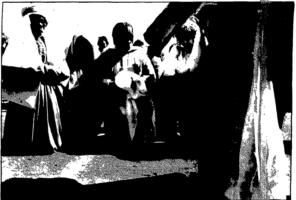
Four "women of Jerusalem" kneel at the feet of Jesus as he tells them "don't weep for me, weep for yourselves and your children," during the reenactment of the Eighth Station of the Cross.