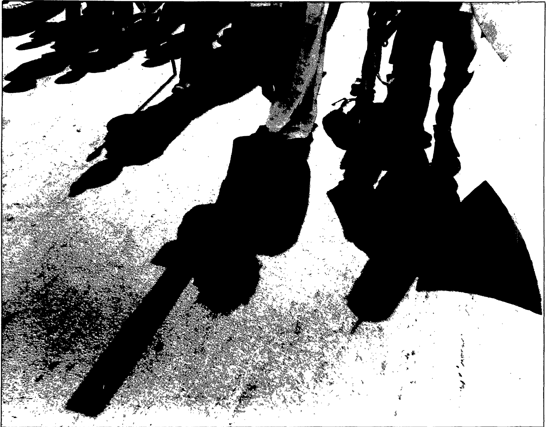
Shadows create eerie images on the pavement as Perez leads the procession down Scio Street, a road that served as one of those "leading to Calvary."