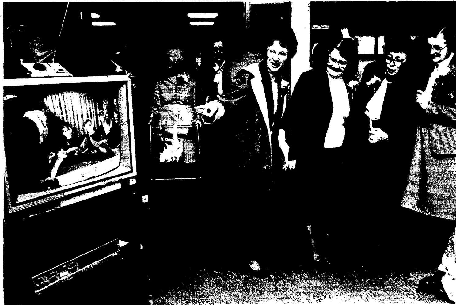
Several Sisters of St. Joseph look at a videotaped performance of the Concert Chorale, which was originally broadcast by a Syracuse television station in 1967.