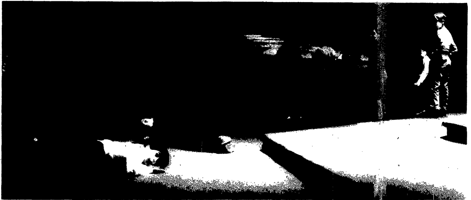
Lester guides the players in an exercise called "Stop, Drop and Roll," teaching them what to do if their clothes were on fire.

With the recent rash of youth related fires, area residents are finding out what those results can be.