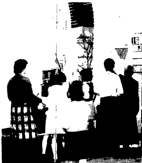
Children from religious education classes decorated a Jesse Tree at the Mass which concluded St. Charles Borromeo's 50th anniversary celebration.

students carried on the parish tradition of decorating the Jesse Tree with hand-made ornaments and symbols.