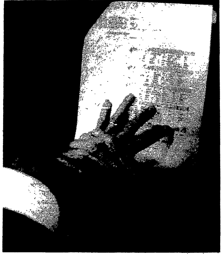
Sister Rosemary Burgio contemplates on the post-Communion reflection.