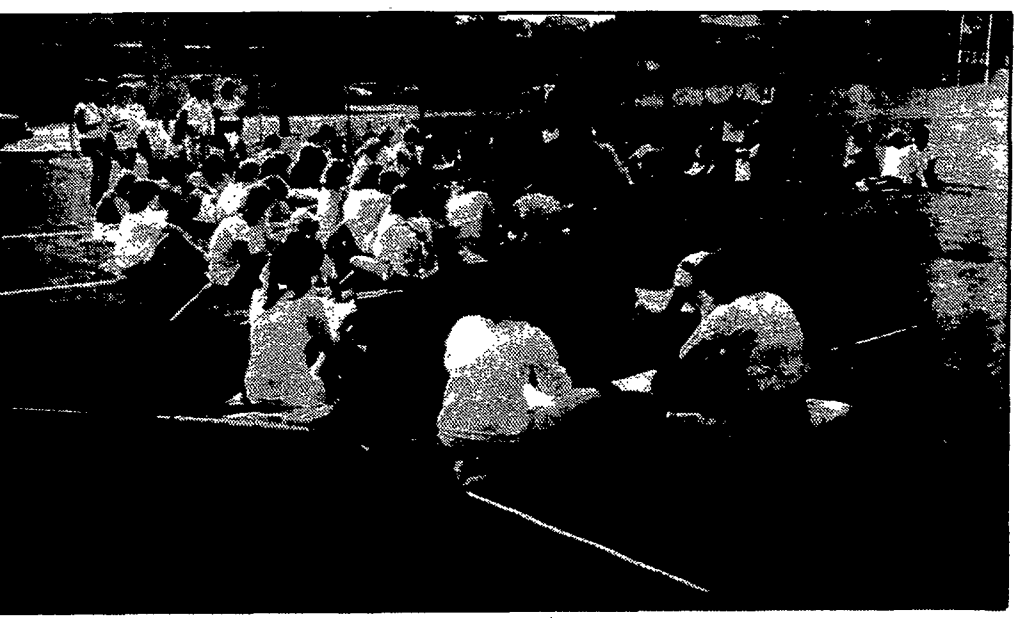
After warming up, students gather to review the day's planned formation instructions.