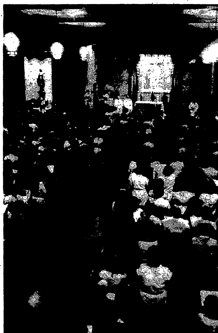
Members of the congregation receive the Eucharist at Our Lady of Mercy chapel, which was filled almost to capacity.