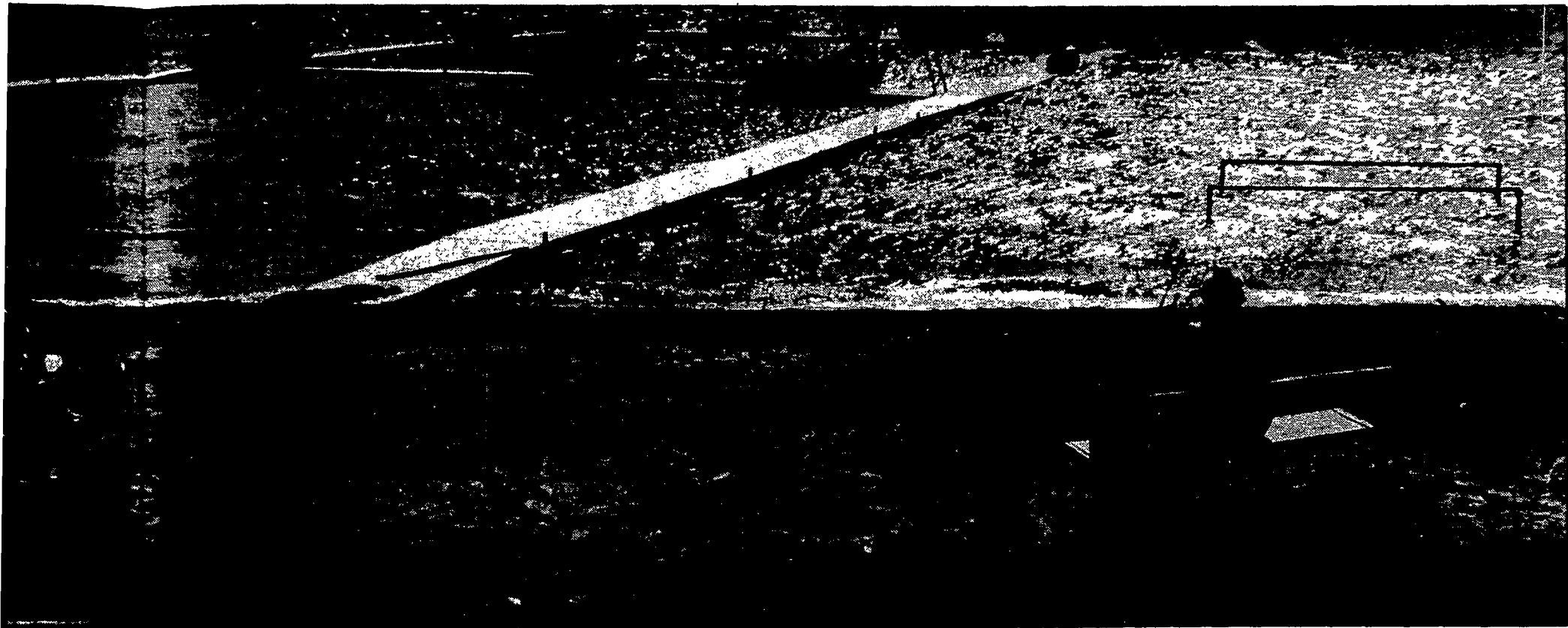
Jeff Goulding / Courier-Journal