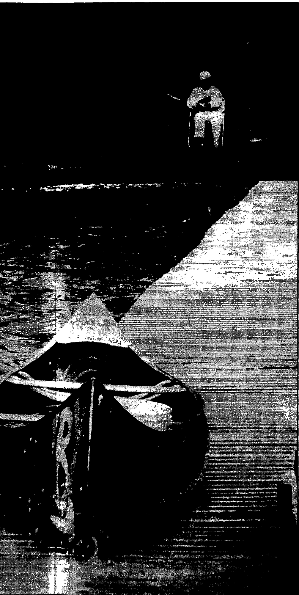
Maureen pauses a moment in her reading to talk with a fellow camper who holds onto a hat to blowing away.