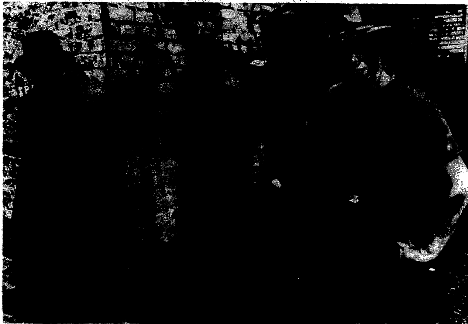
Members of Nicaraguan Invasion Contingency Action colorfully depict the activities of U.S.-backed contras in Nicaragua.