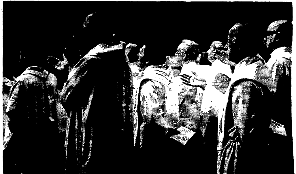
Guest concelebrants extend their hands during the Eucharistic prayer.