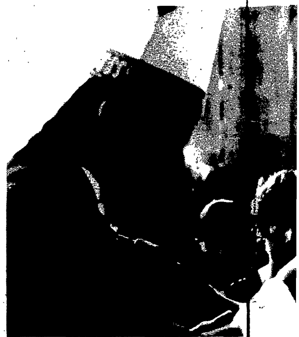
There faces are darker and their ages ranged from 84 to 14, and sacramental graces received are the same. Bishop Clarolatan, clear sign and symbol of the universality of the church.