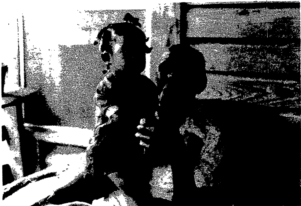
"The needs of the poor are great in this area. About 18,000 people in Dallas County (32% of the county's population) live below the poverty of $10,178 for a family of four. No social service (welfare) benefits are available for men and women who have exhausted unemployment compensation, or who are not eligible for this help. Many individuals and families with no income are thus without resources to buy clothing or household necessities, or to pay their rent and utilities. "Our parish social ministry program assists the poor with direct financial aid..."