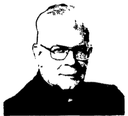
On the Right Side