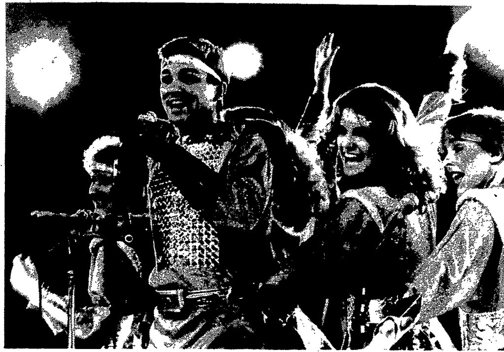
"Robbie Robot" and the Tran-sisters provide a computerized look at music of the future.