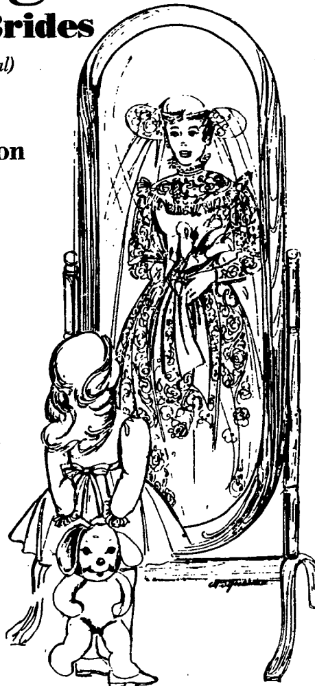
"We'll make your dreams come true"

OPEN MONDAY, WEDNESDAY, and THURSDAY 10 a.m. to 9 p.m.