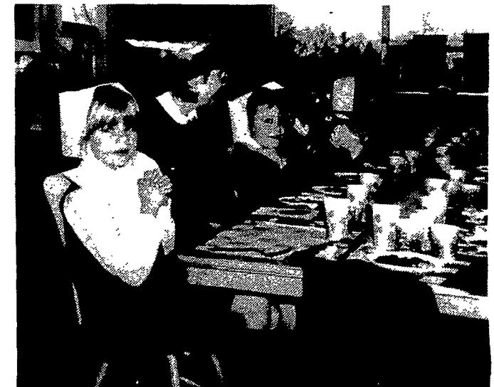
Each first grader dressed as a Pilgrim, with their upperclass counterparts portraying Indians.

Many graduates still return each year to donate to the needy children project, and a common remark is, "The joy of giving is what Christmas is all about."