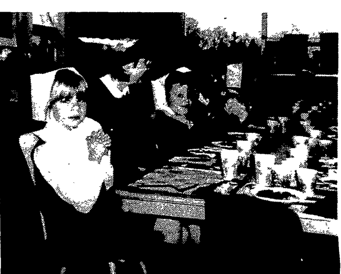
Each first grader dressed as a Pilgrim, with their upperclass counterparts portraying Indians.

Many graduates still return each year to donate to the needy children project, and a common remark is, "The joy of giving is what Christmas is all about.'