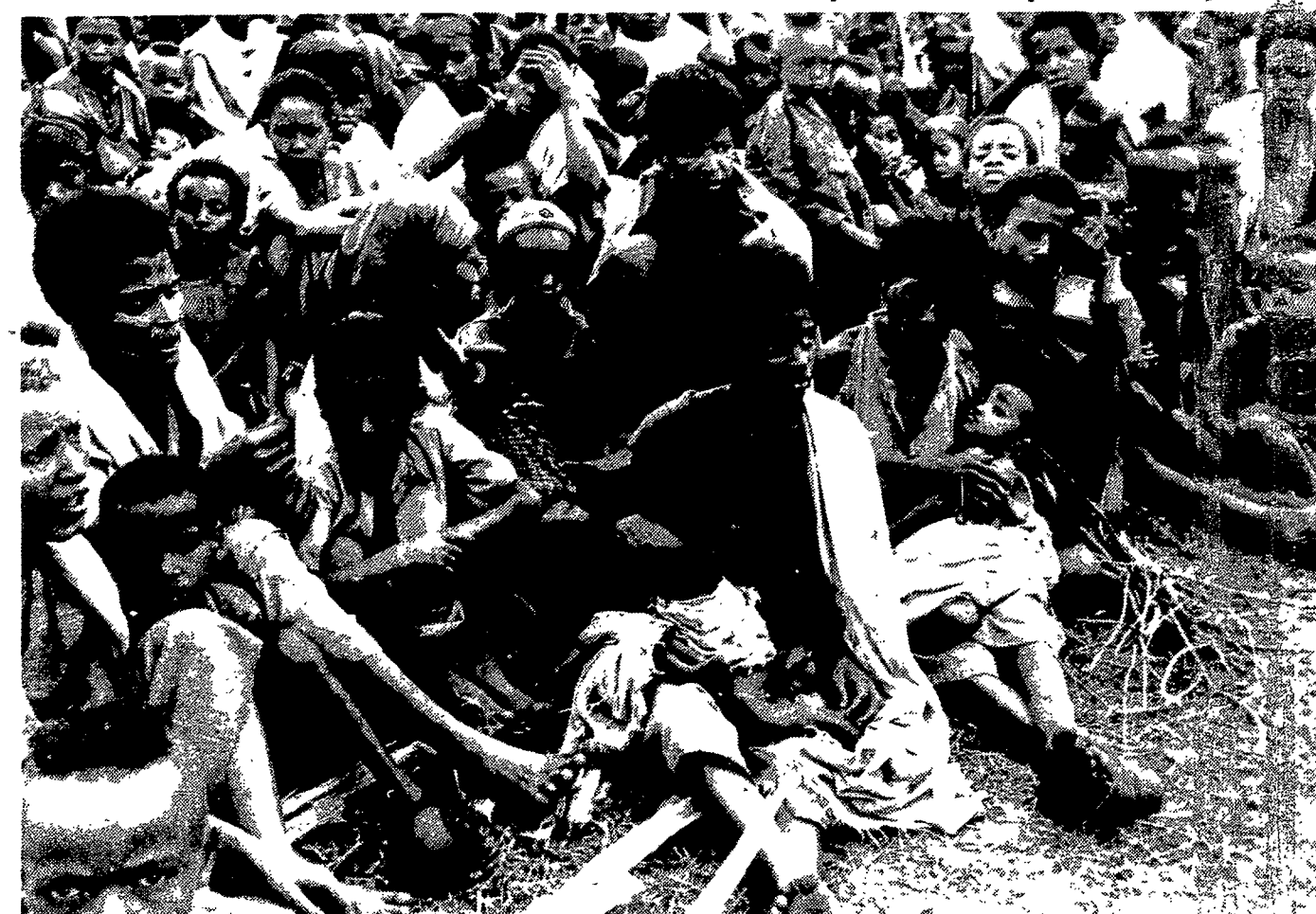
Starving Ethiopians await food supplies at a CRS-sponsored food distribution area in Wollo.

The convocations considered such questions as the focus and agenda of councils; the relationship of councils to other diocesan structures; and the evaluation of councils and their impact on the lives of parishioners.