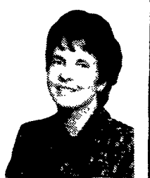
All in the Family