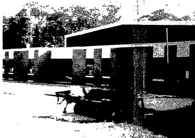
The new building at St. Joseph's Villa nears completion.

This eucharistic prayer concludes "Through him, with him and in him..." May our Amen resound, acclaiming our assent to covenantal relationship in Jesus to God and one another.