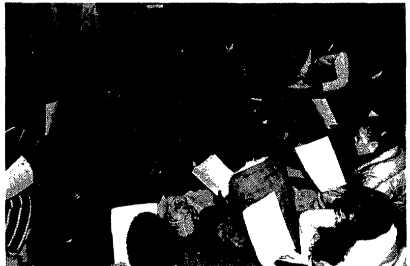
Saturday religion classes at St. Michael's.