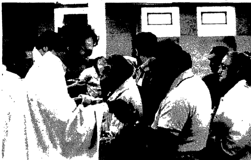
Spanish Apostolate's Mass for the elderly at Mt. Carmel.

"We represent the diocese in the Hispanic community. It's an inter-parish mission, and we prepare programs for evangelization in the Hispanic community, including programs for vocations, the elderly and migrants."