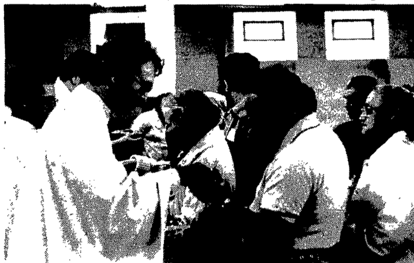
Spanish Apostolate's Mass for the elderly at Mt. Carmel.

"We represent the diocese in the Hispanic community. It's an inter-parish mission, and we prepare programs for evangelization in the Hispanic community, including programs for vocations, the elderly and migrants."