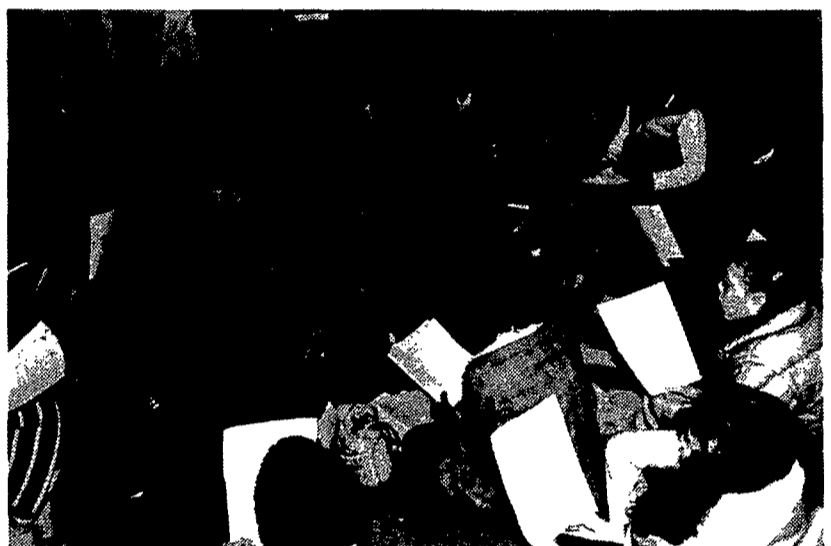
Saturday religion classes at St. Michael's.