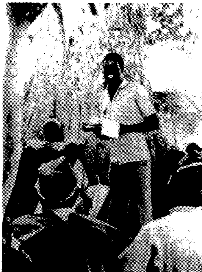
A native lay catechist in Bourkina Fasso (formerly called Upper Volta).

"IF YOU HAVE MET CHRIST, PROCLAIM HIM TO THE WORLD!" Pope John Paul II