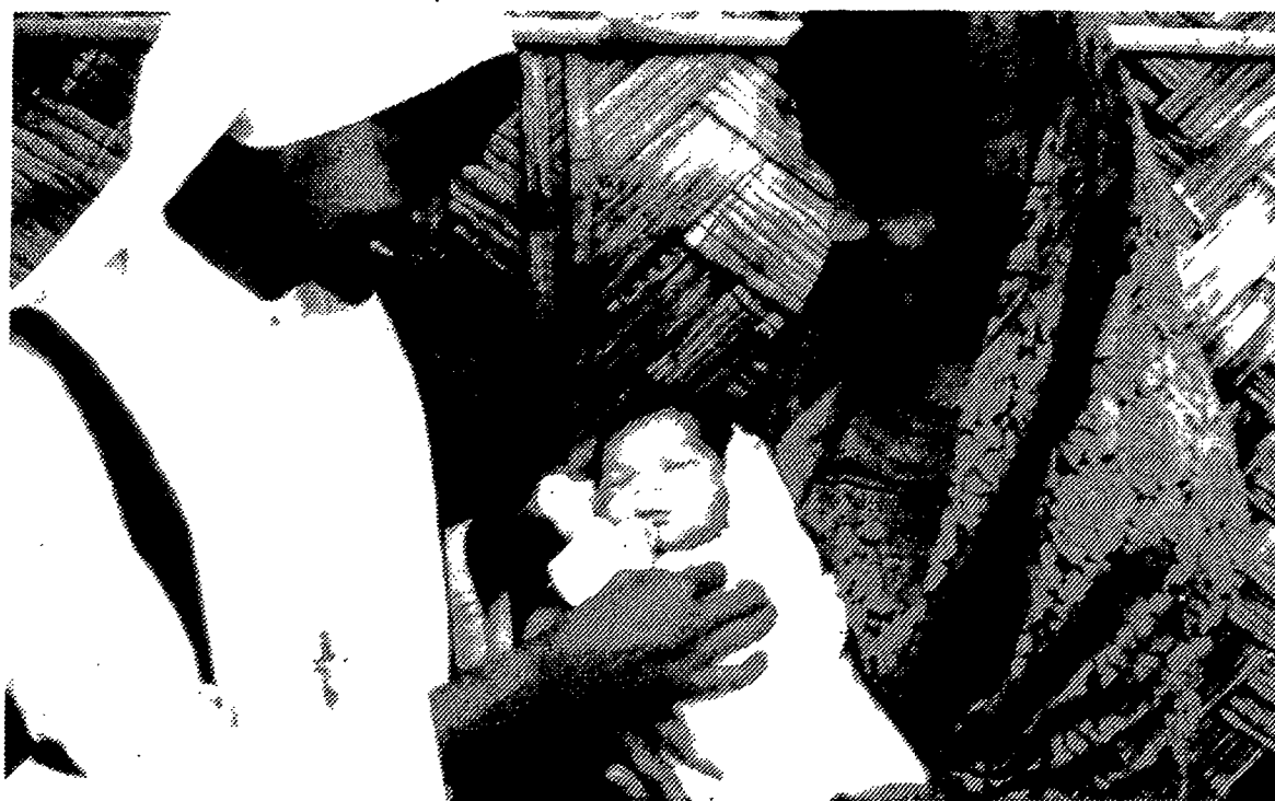
At a clinic in Bangladesh, a native sister with a mother and child.