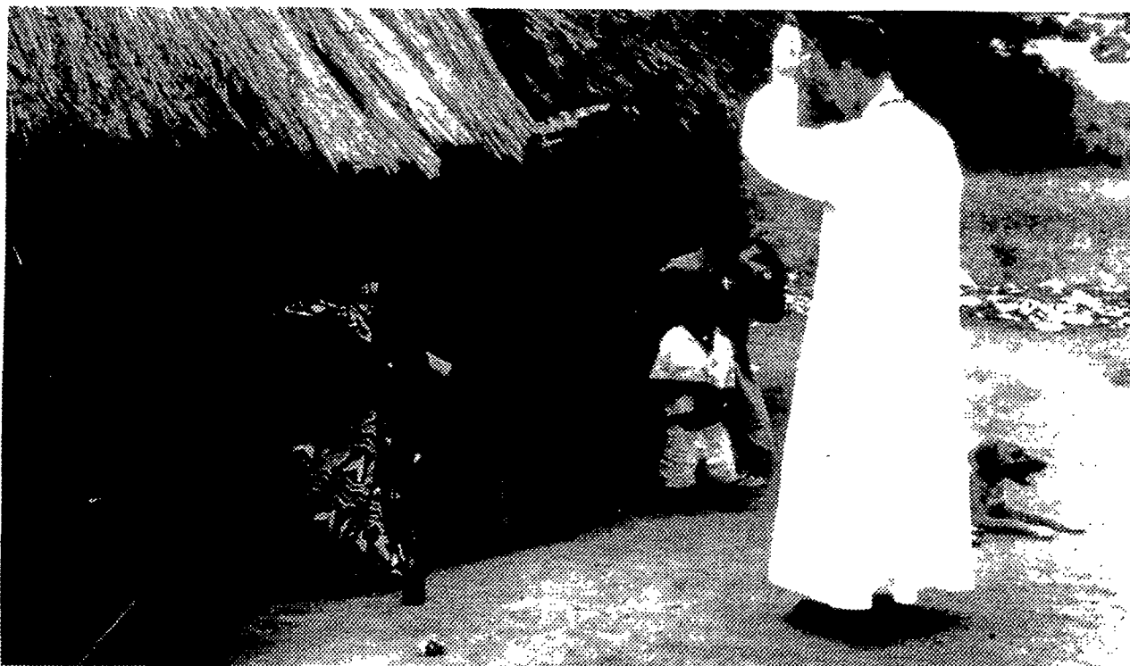
Near Victoria Lake, Tanzania, a missionary priest visits a family at home.

OUR SUPPORT will be felt far beyond the shore: the prayers you encourage and the generosity of your hearts will reach the ends of the earth.