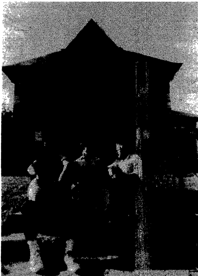
Priests' Sabbatical Program at Rome

"All in all, it was just a great experience and my only regret is that I can't go back and do it again next year. It certainly has encouraged me to take advantage of future courses in Scripture and Spirituality. Those were the two highlights for me."