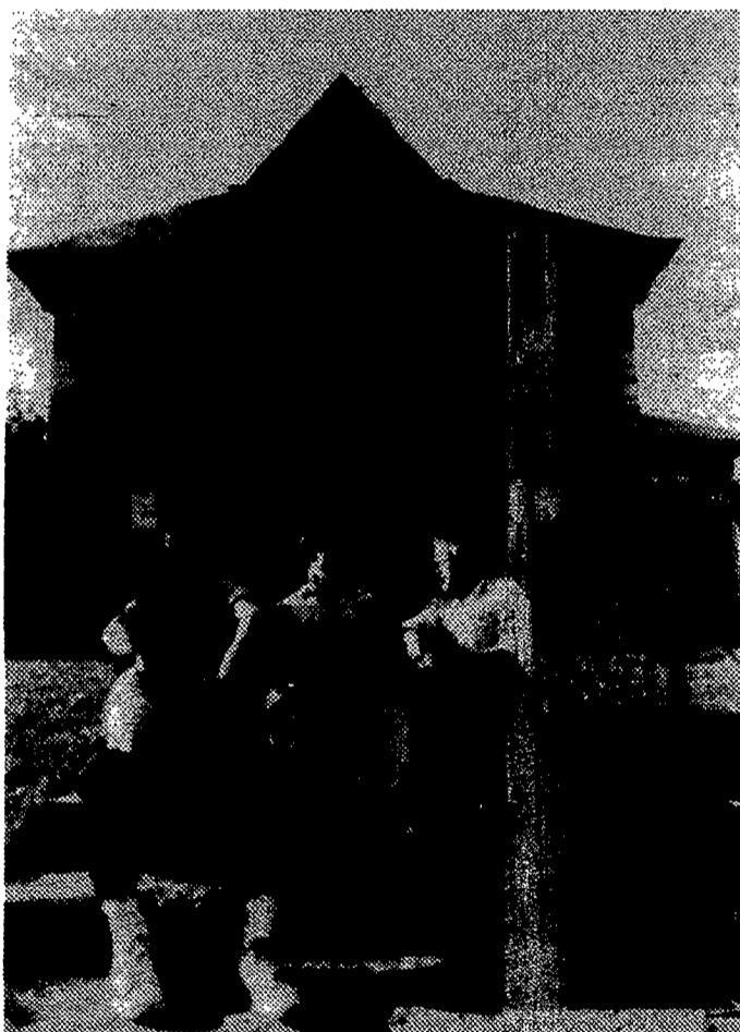
Priests' Sabbatical Program at Rome

"All in all, it was just a great experience and my only regret is that I can't go back and do it again next year. It certainly has encouraged me to take advantage of future courses in Scripture and Spirituality. Those were the two highlights for me."