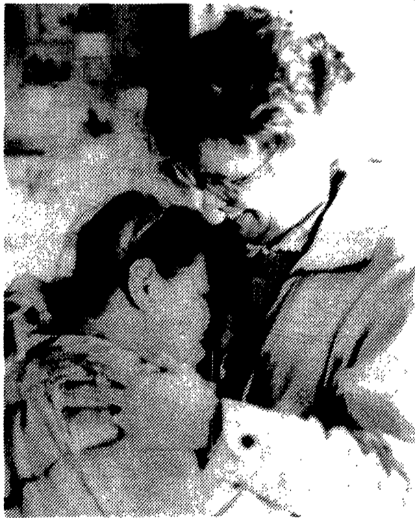
Finger Lakes Office

Composed of five components -- the Office of Human Development, the Bishop Sheen Ecumenical Housing Foundation, the Campaign for Human Development, the Human Life Commission, and the International Justice and Peace Commission -- the department addresses today's issues of justice and peace. The department stresses parish education and advocates for social change to benefit those in need.