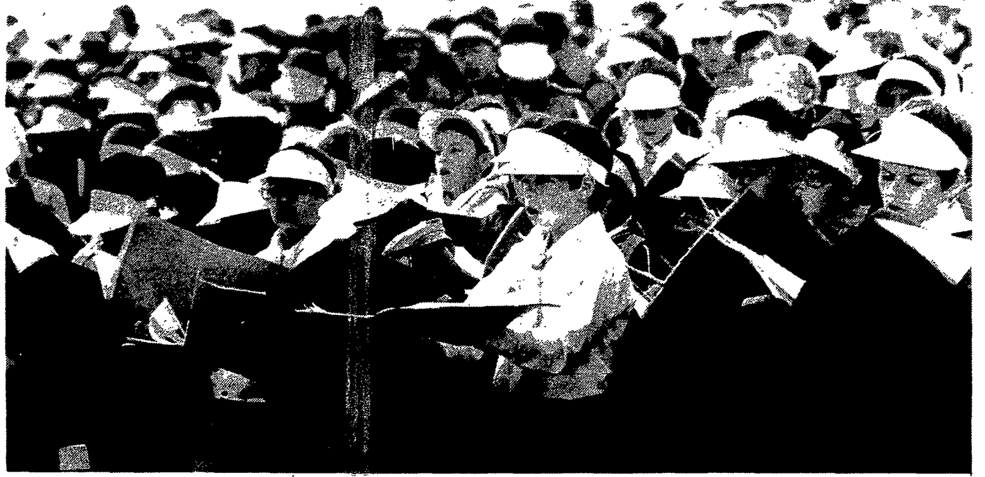
Children in song are part of a 10,000-voice choir which sang the sacred music during the pontiff's celebration of the Eucharist.