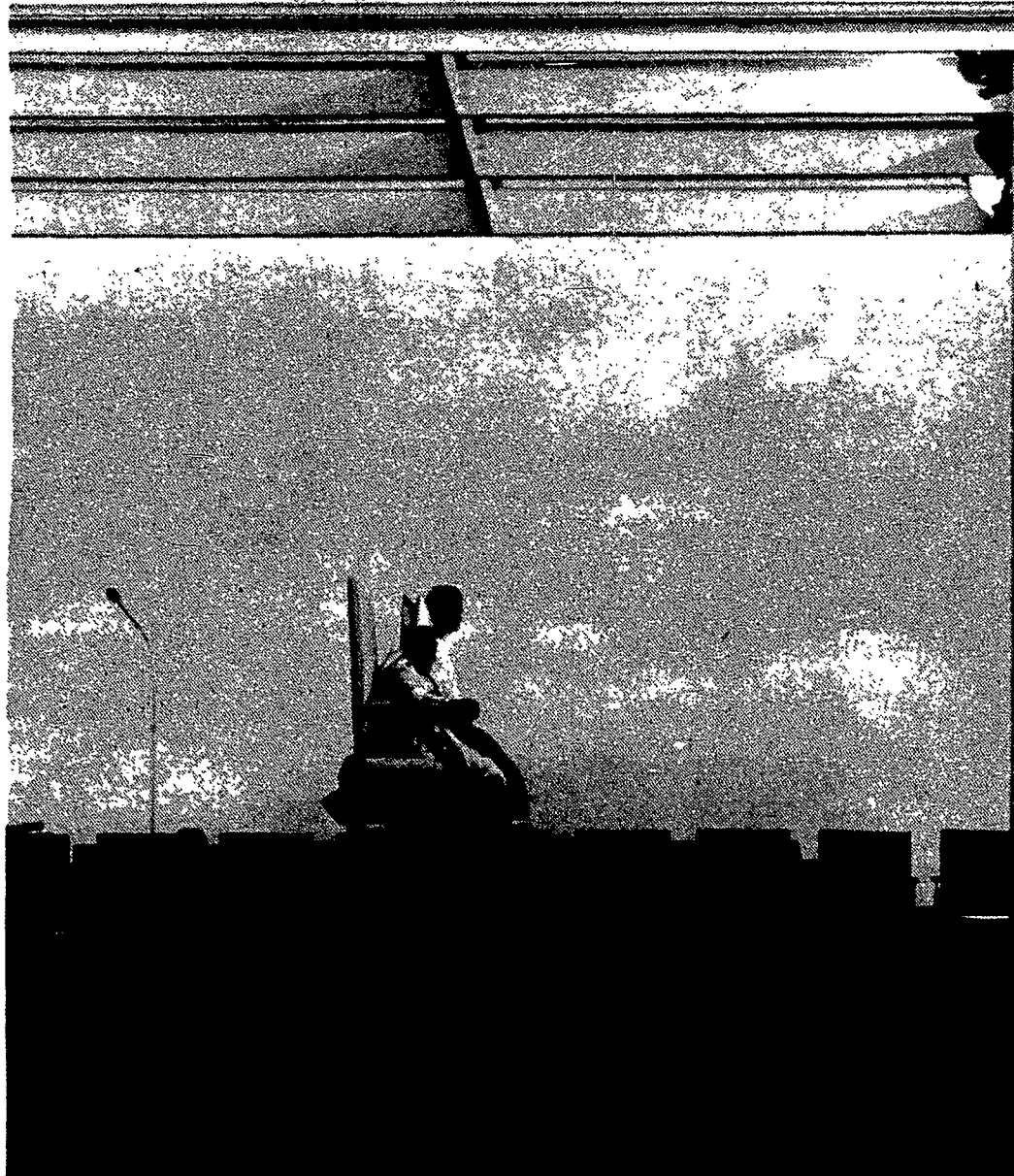
The Vicar of Christ is seated beneath the canopy on Downsview Airfield.