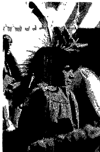
A youngster in Amerindian headdress awaits the pontiff's arrival.