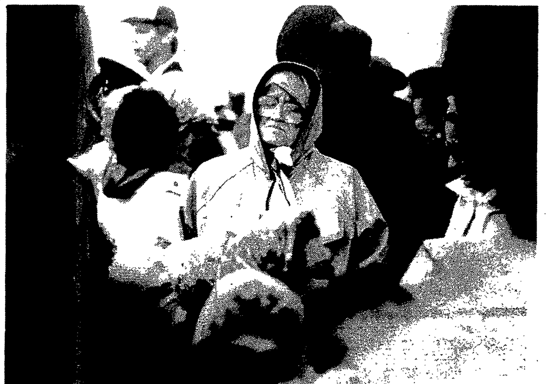
Woman prays alone in the crowd.