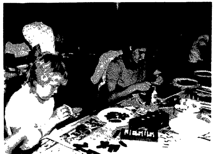
An arts and crafts session.

The emphasis is on social justice. The themes for each day are set by the songs of