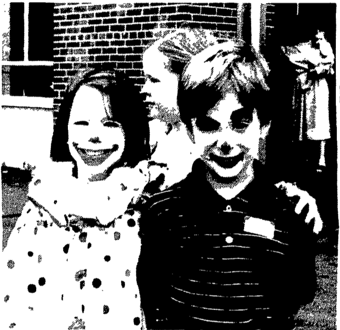
Smiling faces. Enjoying the results of learning how to apply clown makeup.