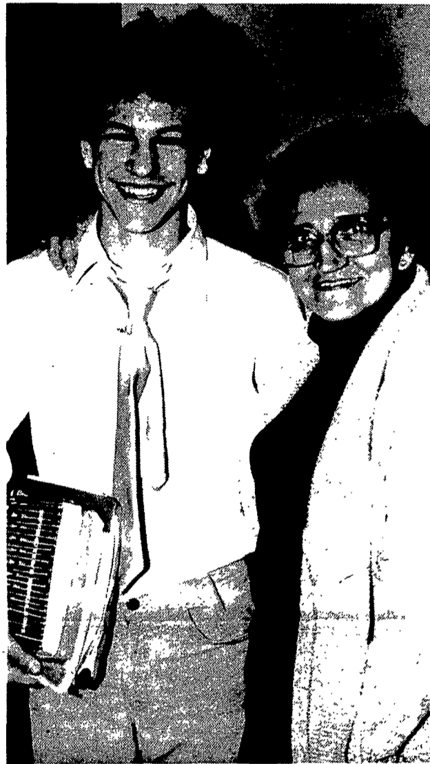
Yes! Teachers and pupils can be friends.