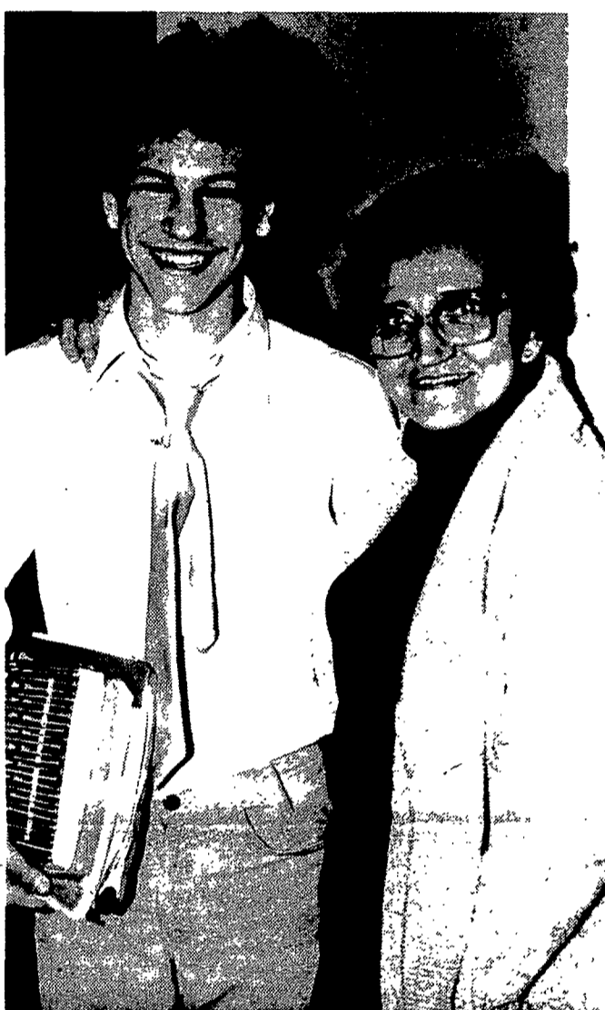
Yes! Teachers and pupils can be friends.