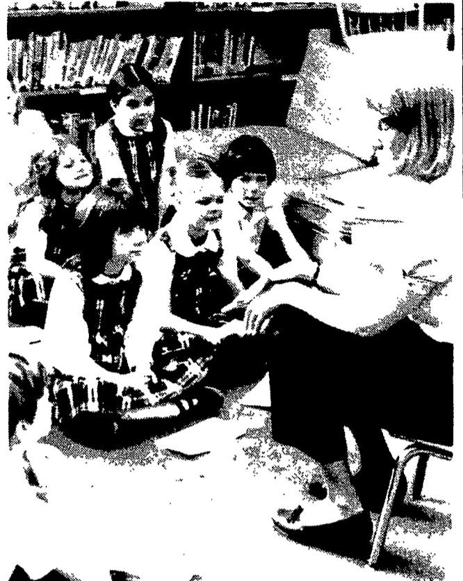
Storytelling -- one of the oldest of the arts, captures eager hearts.