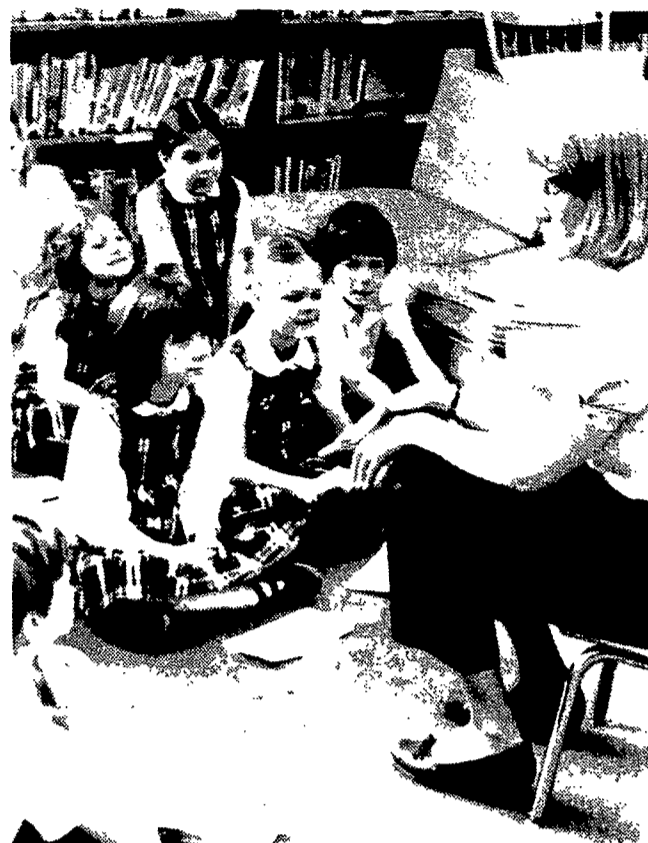
Storytelling -- one of the oldest of the arts, captures eager hearts.