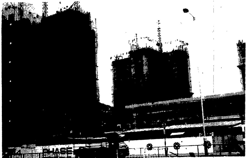
High rises fill the bill for burgeoning population in Hong Kong area.