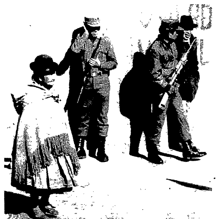
Bolivian soldiers patrol the streets of La Paz during a nationwide general strike called by union workers demanding higher salaries and lower prices. The union also rejected a series of last minute proposals from the government.