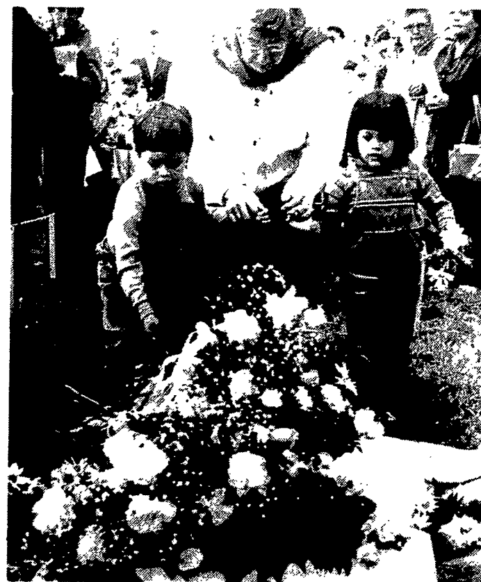
Two children place flowers on caskets containing 11 fetuses during a non-denominational funeral service in Milwaukee's Holy Cross Cemetery. They were discovered by youngsters playing near a trash bin behind a medical center on the city's north side. The fetuses were buried in a baby section plot donated by the Milwaukee archdiocese.