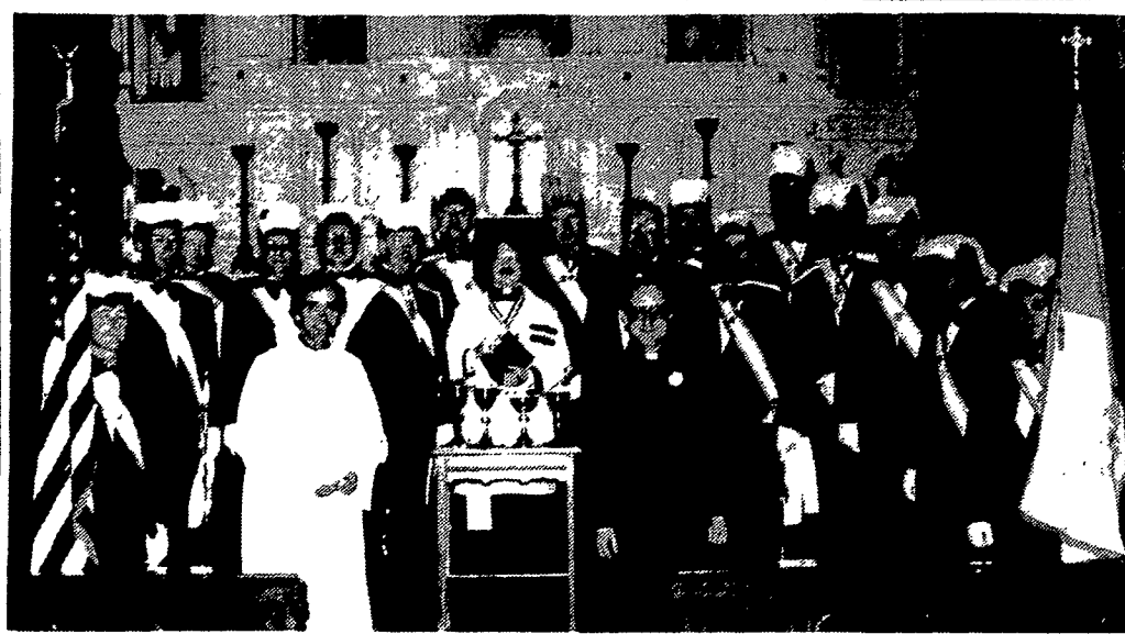
A class of 32 candidates received the Fourth Degree of the Knights of Columbus recently.