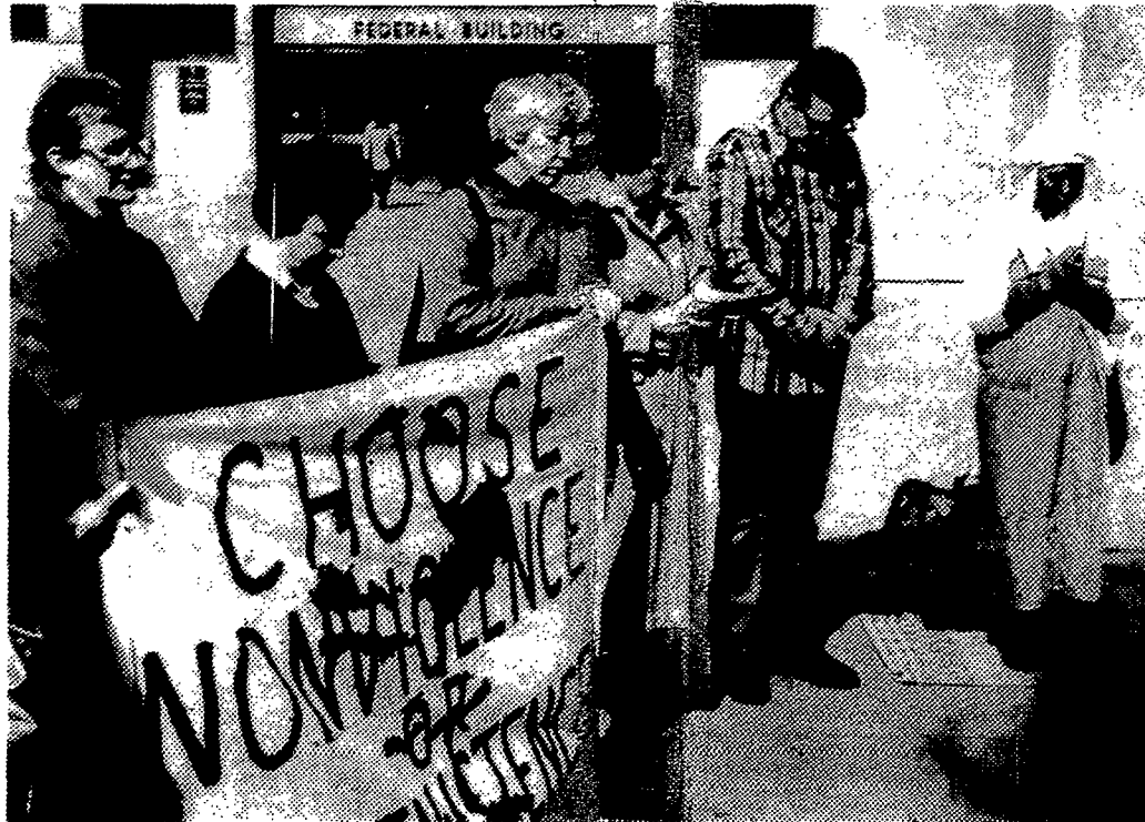
Peace activist Elizabeth McAlister, third from left, prays with supporters before entering Federal District Court in Syracuse for the trial of the Griffiss Plowshares Seven. They are charged with entering Griffiss Air Force Base in Rome last Thanksgiving and damaging government property. If convicted, Ms. McAlister, the wife of Philip Berrigan, could face up to 25 years in prison.