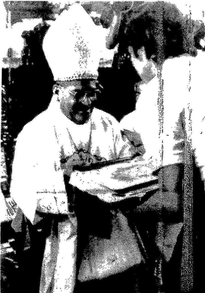
Archbishop Miguel Obando Bravo of Managua, Nicaragua, receives petitions signed by people supporting the Nicaraguan bishops who recently issued a pastoral letter that called for negotiations between government and guerrillas.