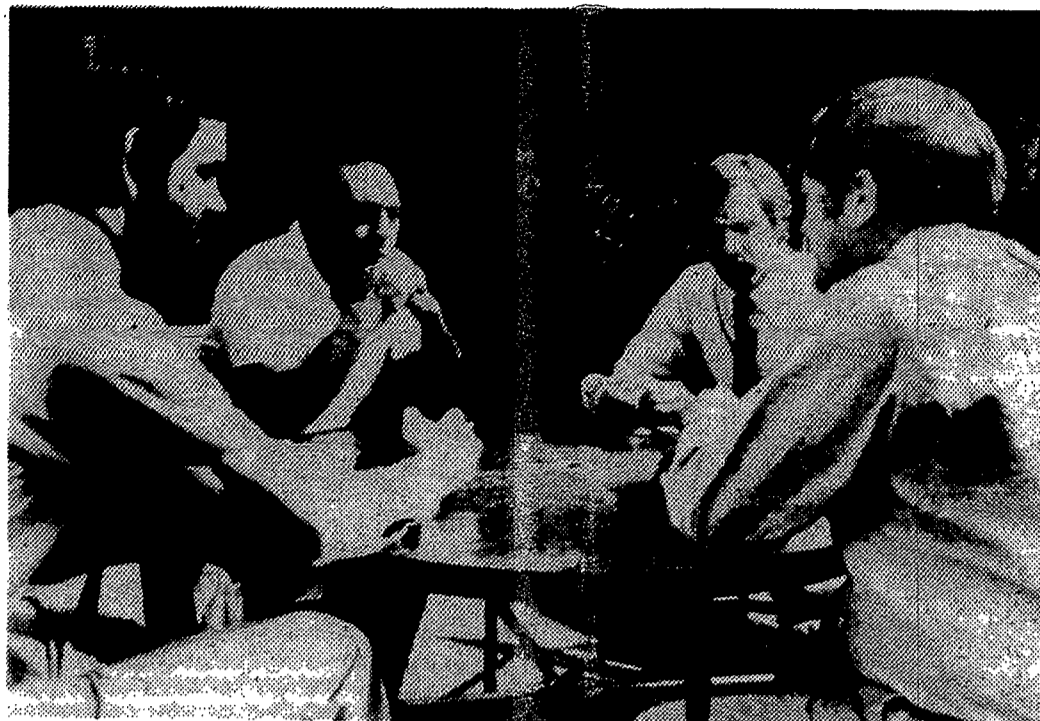
Salvadoran presidential candidate Jose Napoleon Duarte, second from left, talks with lawyers and a relative of one of the four American church women killed near San Salvador in 1980. The lawyers represent families of the missionaries. The trial of the Salvadoran National Guardsmen accused of the murders is expected to begin following the May 6 elections.