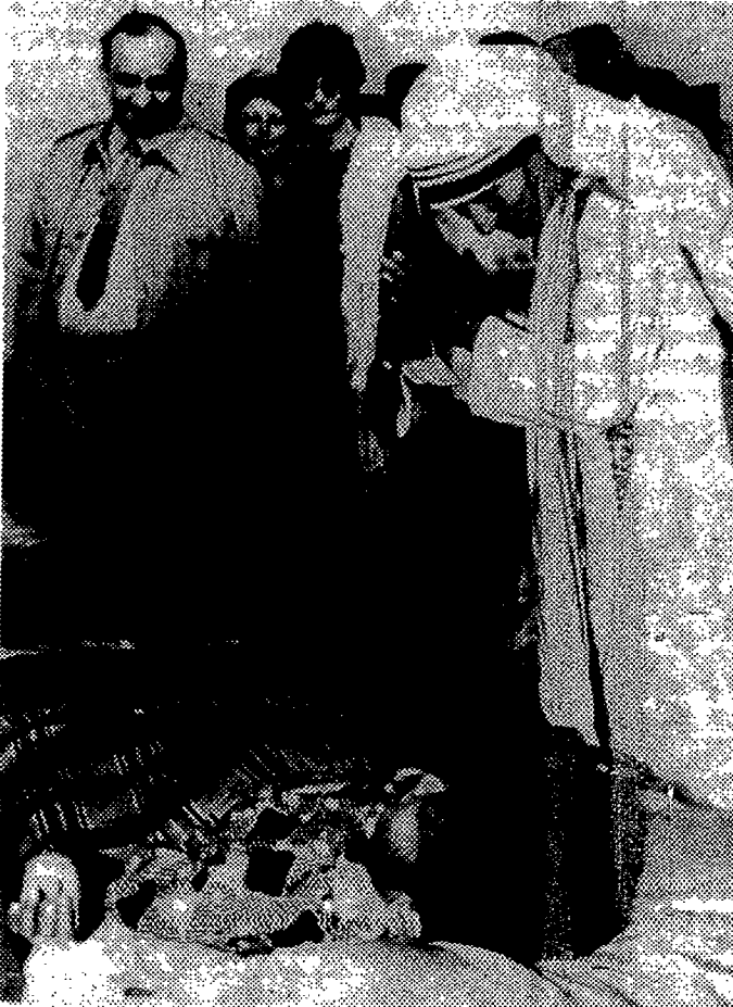
Mother Teresa of Calcutta introduces one of the patients at her home for dying destitutes in New Delhi to Austrian Chancellor Fred Sinowatz and his wife. The chancellor later donated medicine for use in the home.