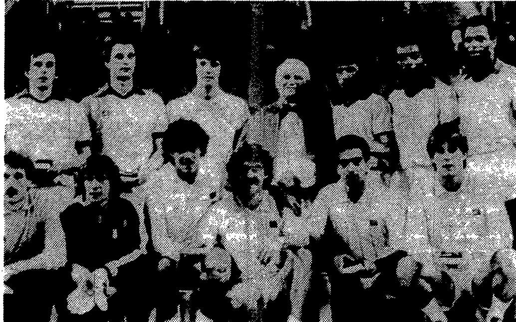
Pope John Paul II poses with foreign members of Italian soccer teams during the International Athletes Jubilee at Rome's Olympic Stadium. The group included players from France, Poland, the Netherlands, Argentina, Peru, England, Austria, Denmark and West Germany.