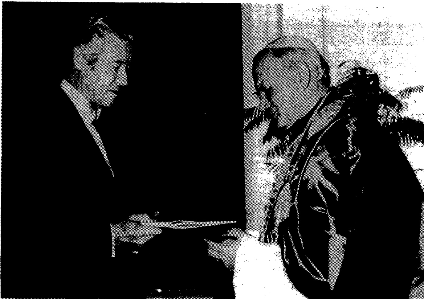
Pope John Paul II receives credentials from William Wilson.

Part of the greatness of the American ideal is, without doubt, an openness to other peoples: not in the sense of