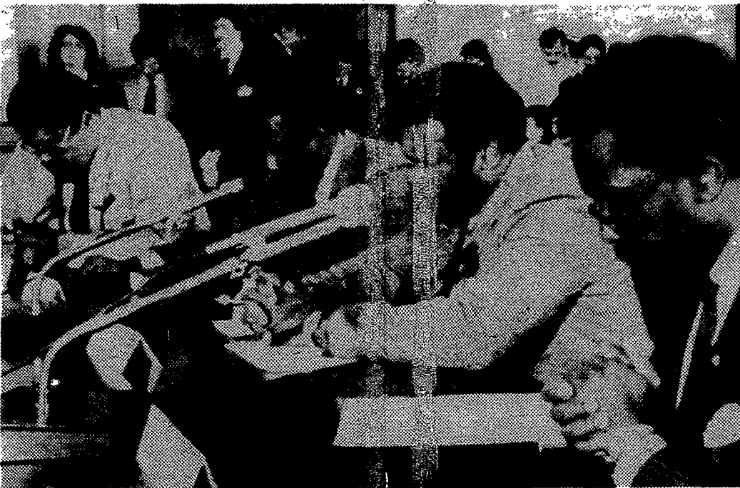
Prior to speaking at a forum sponsored by the House Republican Study Committee on prayer in public schools, former Los Angeles Rams star Rosey Grier, former Harlem Globetrotter Meadowlark Lemon, former Baltimore Colts star Lenny Moore, and actor Demond Wilson bow their heads in prayer.