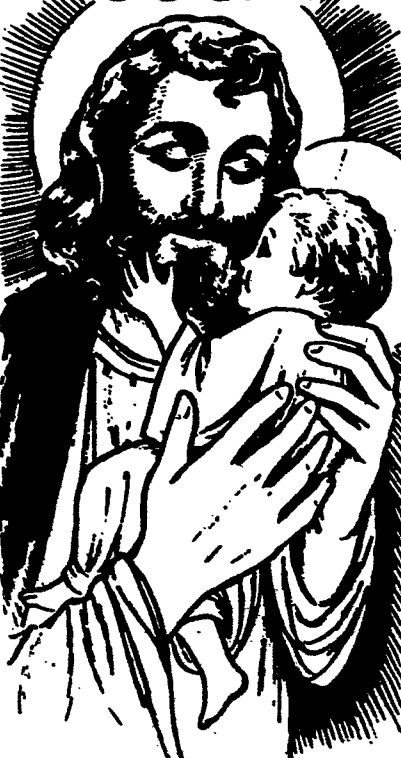
AFTER MARY, ST. JOSEPH IS OUR GREATEST INTERCESSOR.

ST. JOSEPH WAS BORN OF THE ROYAL FAMILY OF DAVID, BUT HE LIVED IN OBSCURITY AS A CARPENTER WHEN GOD CHOSE HIM TO BE FOSTER FATHER AND GUARDIAN OF JESUS AND SPOUSE OF THE VIRGIN MARY. SCRIPTURE SAYS JOSEPH WAS A JUST MAN. HE WAS INNOCENT, PURE, GENTLE, AND PRUDENT. JOSEPH WAS OBEIENT TO GOD'S CALLS THOUGH HE OFTEN WAS DEEPLY DISTURBED BY THINGS HE DIDN'T UNDERSTAND, SUCH AS: HOW MARY COULD BE WITH CHILD UNTIL AN ANGEL EXPLAINED; AT THE PRESENTATION OF BABY JESUS IN THE TEMPLE WHEN SIMEON FORETOLD A SWORD WOULD PIERCE MARY'S HEART; WHEN THE HOLY FAMILY FLED INTO EGYPT TO ESCAPE HEROD'S CRUEL SLAUGHTER OF INFANT BOYS, AND AT THE LOSS OF THE CHRIST CHILD FOR THREE LONG DAYS. AS NO FURTHER MENTION IS MADE OF ST. JOSEPH, HE MUST HAVE DIED BEFORE THE MARRIAGE AT CANA AND THE START OF JESUS' PUBLIC MINISTRY. HE IS ESPECIALLY INVOKED FOR THE GRACE OF A HAPPY DEATH. HE IS ALSO PATRON OF THE UNIVERSAL CHURCH. THE FEAST OF ST. JOSEPH IS CELEBRATED ON MARCH 19.