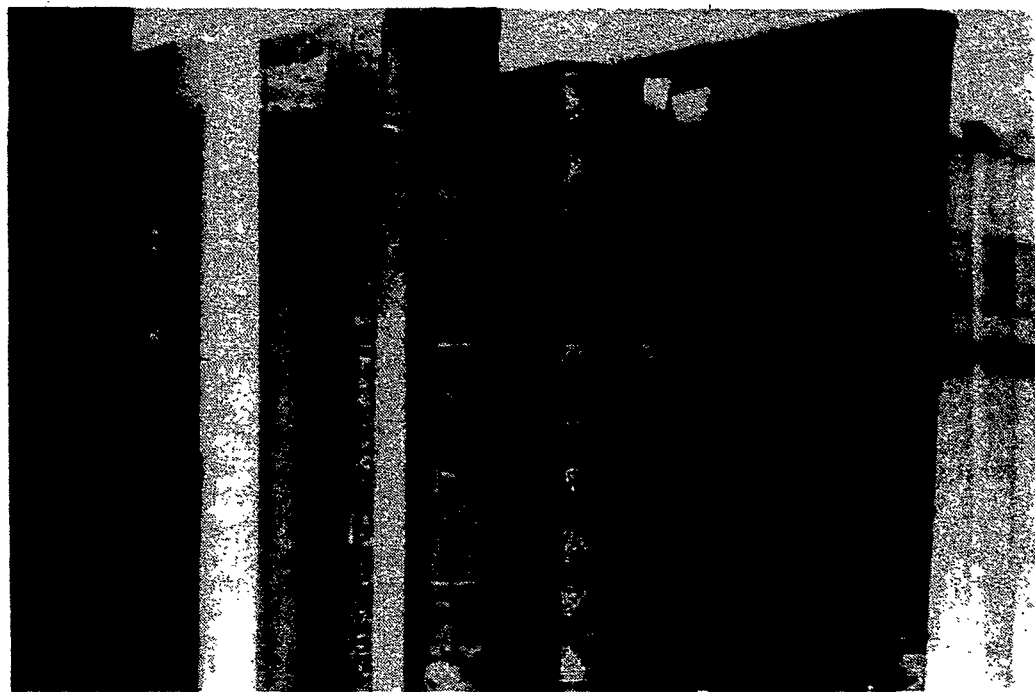
Some of the Institute's public collection.