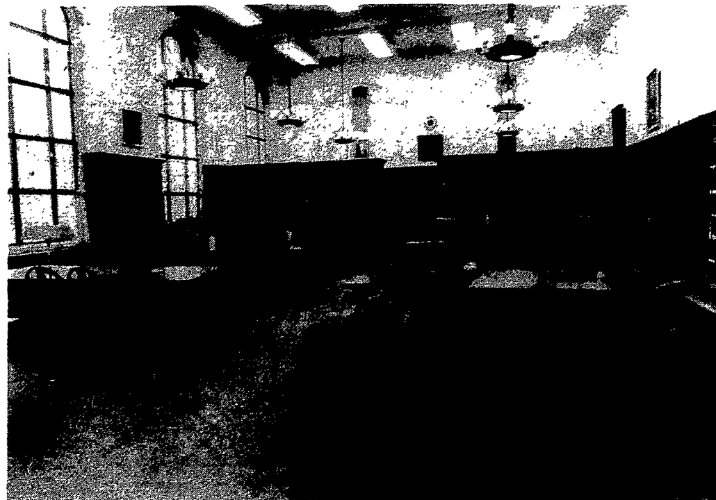
The reading room of the Ambrose Swasey Library.

Registration... at Holy... be taken... l-3 and... Feb. 29... and 1-3... March 1... ation fee... runs Sept... 7, 1985... of the... formation... illing 247-