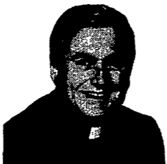
The Open Window