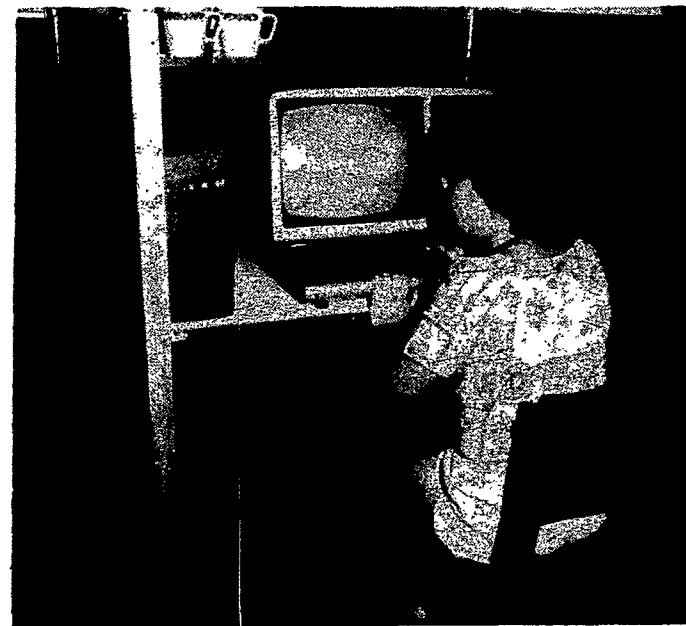
The age of computers at St. Patrick's, Elmira.