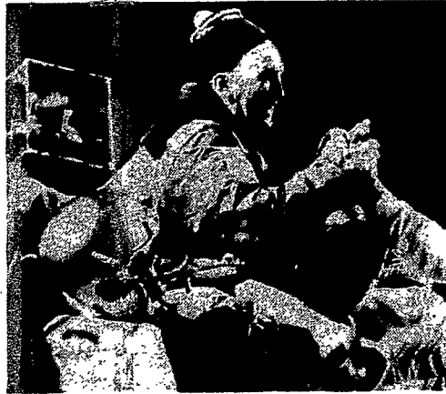
Notre Dame tailback Allen Pinkett dives over teammates and opponents for a touchdown in the Liberty Bowl in Memphis, Tenn. The rare bowl match-up between two Catholic schools -- which had been tagged the "Rosary Bowl" by some -- saw the Irish defeat Boston College, 19-18. Notre Dame coach Gerry Faust is hoisted to the shoulders of his jubilant players after the upset victory.