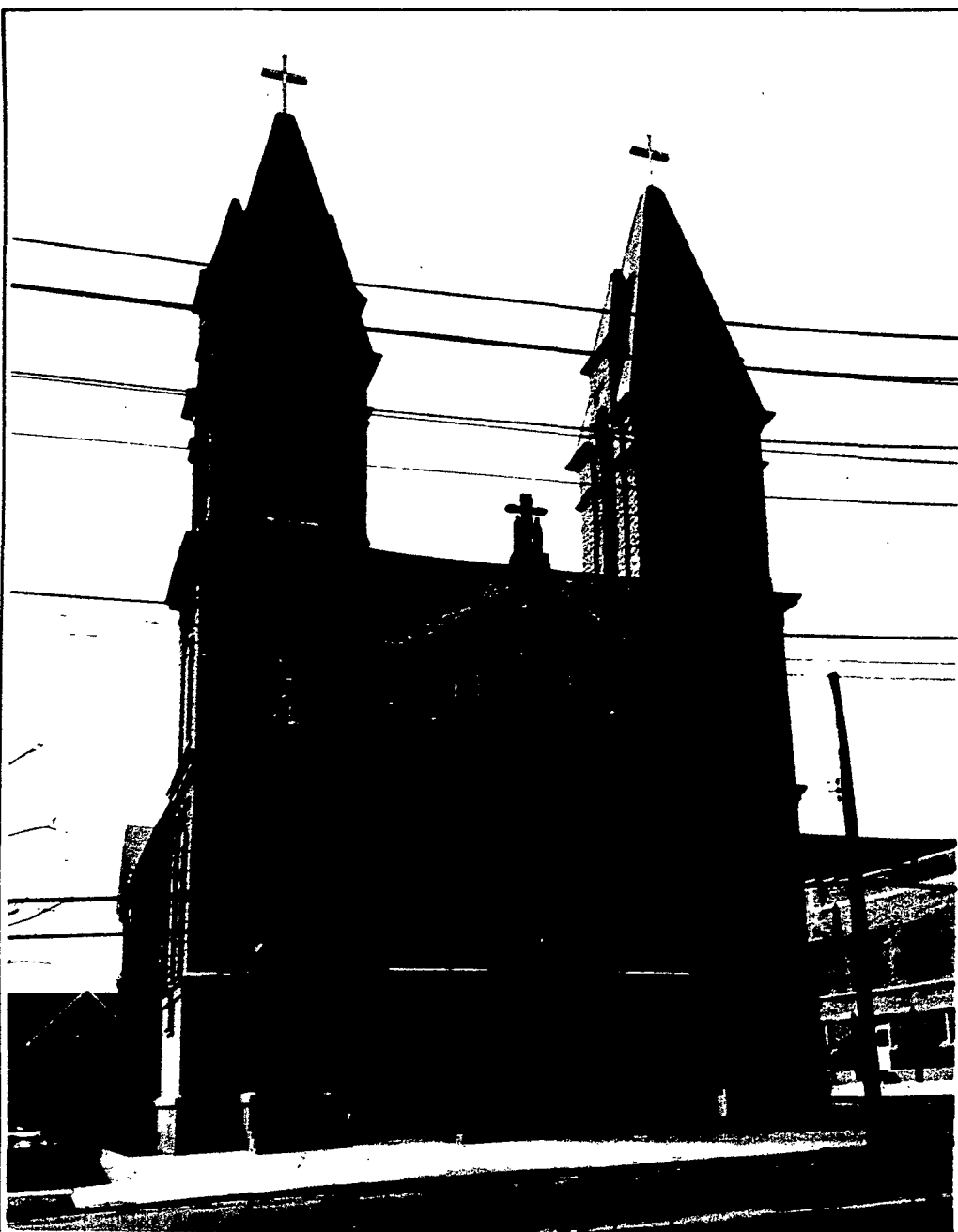
Holy Family, Auburn