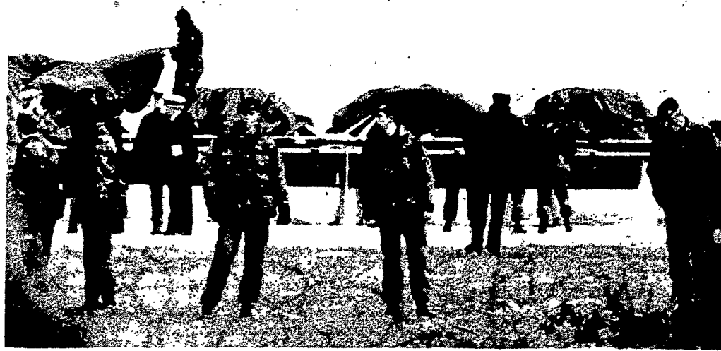
British paratroopers encircle a vehicle as servicemen draw tarpaulins over equipment believed to be warheads for cruise missiles. The transporter was unloaded from a U.S. plane at Greenham Common Airbase in England. Women demonstrators attempted to block the gate to the airbase and more than 120 were arrested.