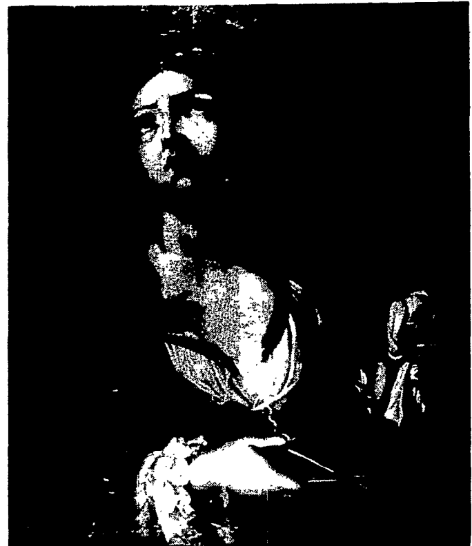
The 17th century portrait of St. Agatha.

The 26" x 30" portrait depicts St. Agatha, a woman of nobility miraculously healed of her wounds of torture. The delicate process