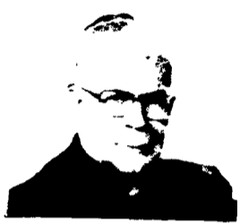
On the Right Side